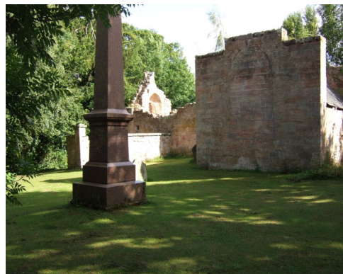
Old Cockpen Church (c.1148)