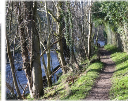
Riverbank North Esk