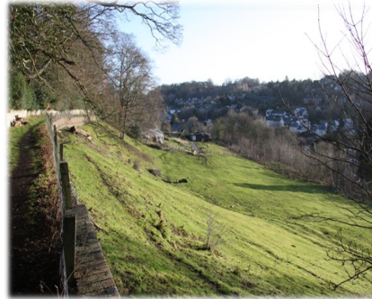
Path above Lasswade

Springfield Mill nature reserve, site of former paper mill