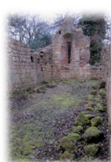
Old Cockpen Kirk

Turn left and cross safely at Sun Inn before heading right, then left onto Carrington Road. Turn left at sign to Dalhousie Bridge and continue along river and past Groves Farm to Dalhousie Castle. Bear to left of Castle and over bridge to path with steps on left. Continue uphill and keep to left to cross stile over gate. Turn right and through 2 kissing gates, passing Old Cockpen Kirk on left. Head along small path to open grassland, heading