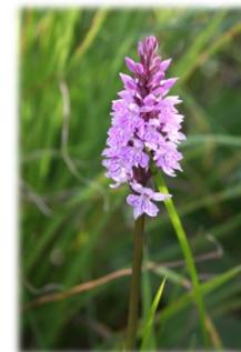
Common Spotted Orchid

Opportunity to add a Visit to Roslin Chapel