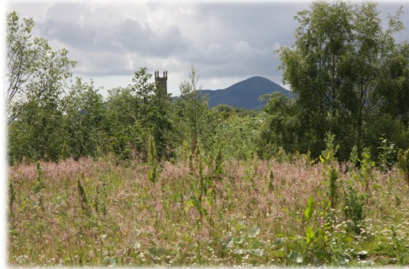
Dryden Tower and distant Pentland Hills

In ½ mile from the viaduct, two paths rise up to the left (the 2nd is less muddy), then continue right, to reach a green sign for Bilston. At the top of the rise (left) there are big views all round including the Pentlands and the slender Dryden Tower peeking over the trees.