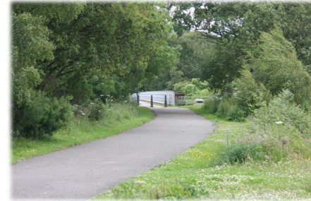
Cycle path and Bilston Viaduct

Start as above until across the Bilston Viaduct. Continue on the tar path through Loanhead. Further on, just before the City Bypass, turn left to visit Straiton Pond. Return by the same route.