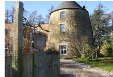
The Old Windmill

Turn right for 100m along main road and then right (Signposted: D'Arcy, Mayfield) onto minor road for 600 m until road touches the edge of wood. Proceed south-east on track along edge of wood for 600m to Spy Law Wood where it joins farm road. Turn left along the road for 500m. Then take track through wood for 200m, then turn left on track for 100m passing Windmill House arriving at main road (B6372 again) and village of Edgehead.