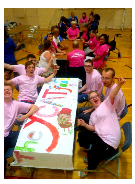
Community Access Team support adults with a learning disability in Midlothian