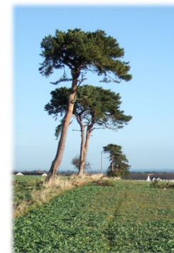
Scots Pine Poltonhall