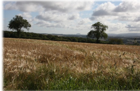
Ripe barley, Airfield Farm

Start at the main entrance to Vogrie Country Park. Before exiting the main gate turn left in front of the gate lodge onto woodland path signed Newlandrig. Exit onto public road and continue left to Newlandrig. After