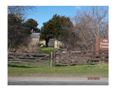
Entrance to Old Pentland Cemetery

Turn left and continue on the main road for about a mile, then turn right (with care!) into a narrow road to Damhead which is signposted to Old Pentland.