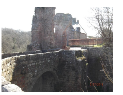
View of Rosslyn Castle

hamthorien the pavement beside the dual car- At the next junction turn right again and riageway heading past Glencorse continue by the Old Pentland Cemetery Cemetery. Keep to the old road to the A701. Go straight across and maHace's where the new road swings right, keep in the outside lane, turn right on the bend but, instead of turning into the