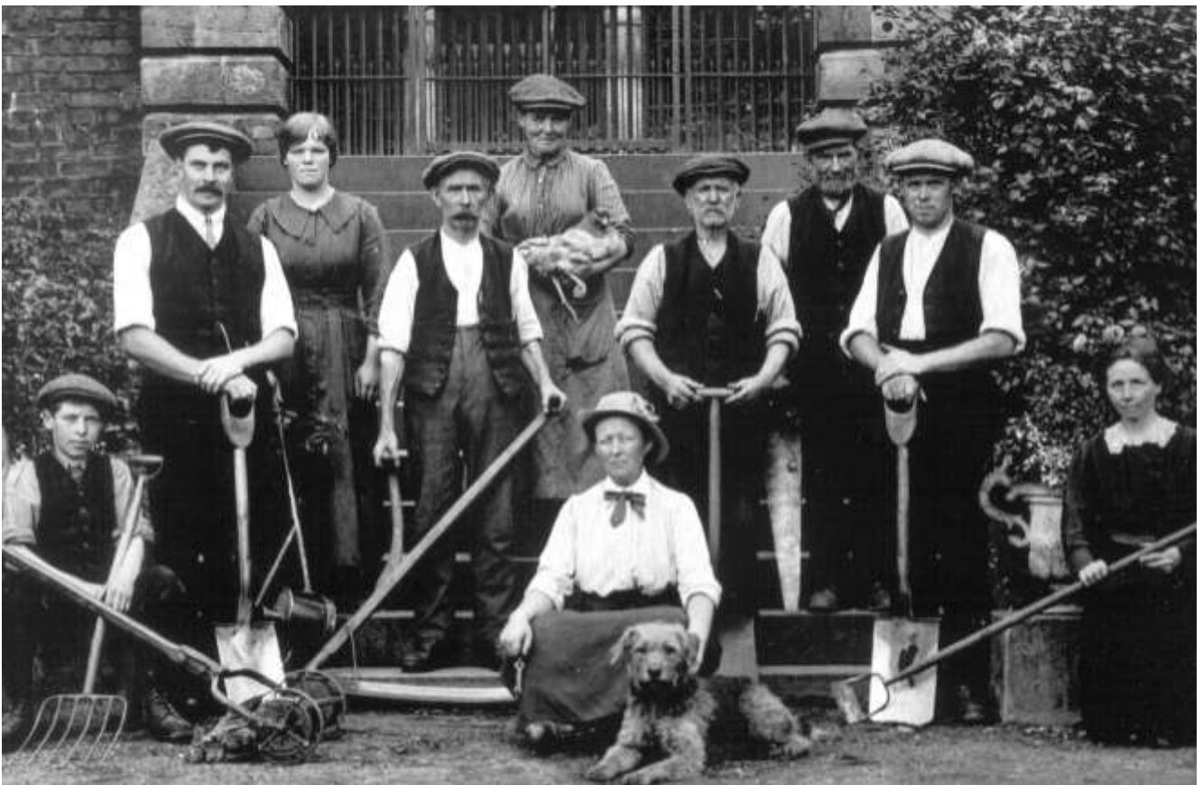
Gardening staff at Mavisbank house near Loanhead, c.1914. Originally built for the Clerk family of Penicuik, Mavisbank was a private asylum at this time.