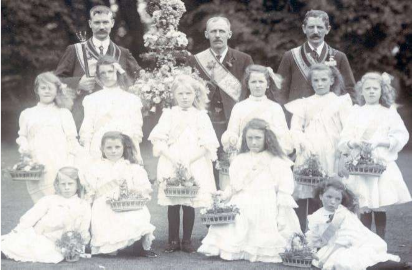
The Penicuik Free Gardeners was a friendly society whose main aim was the mutual support and protection of its members. The Gardeners held annual processions which included young girls dressed in white and bearing baskets of flowers who represented the ten virgins of the Bible.