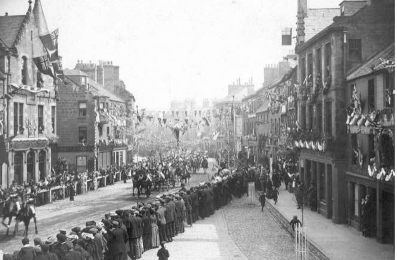
Dalkeith High Street was packed with cheering crowds for the visit of King Edward VII and Queen Alexandra in May 1903.