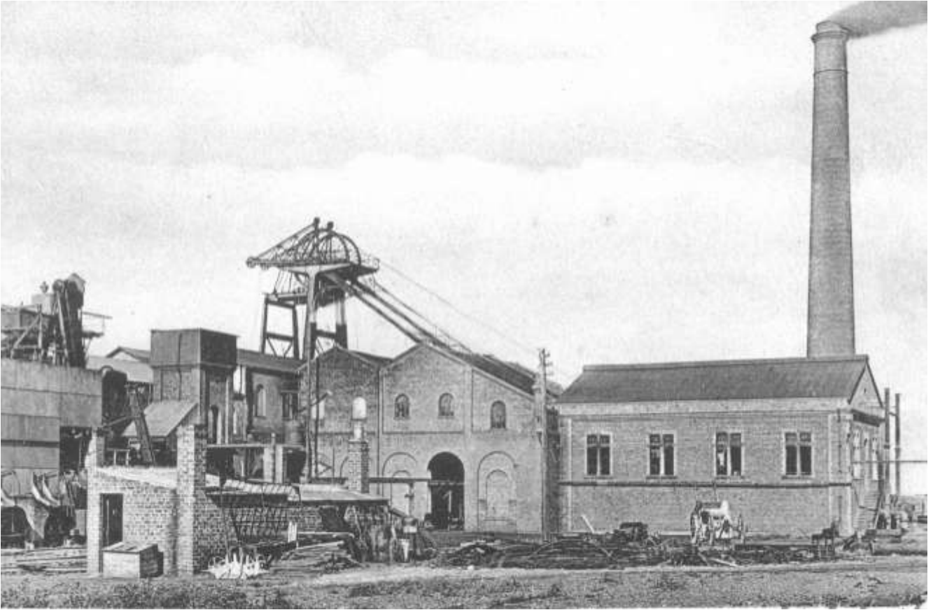
The Lady Victoria pit at Newtongrange was the centrepiece of the Midlothian coal industry. Owned by the Midlothian Coal Company, it was opened in 1895.