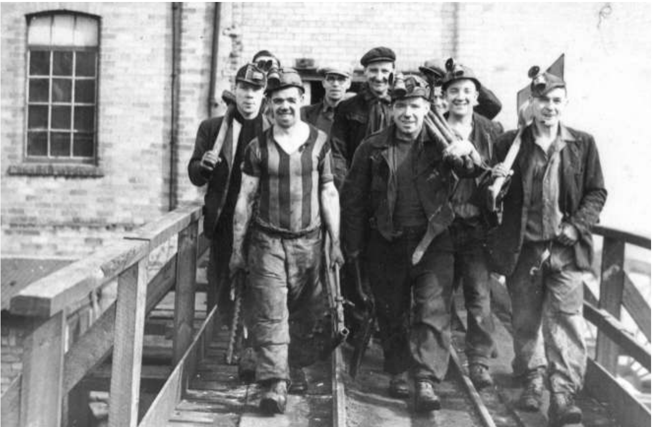
Workers at the Ramsay colliery in Loanhead exiting after a shift.