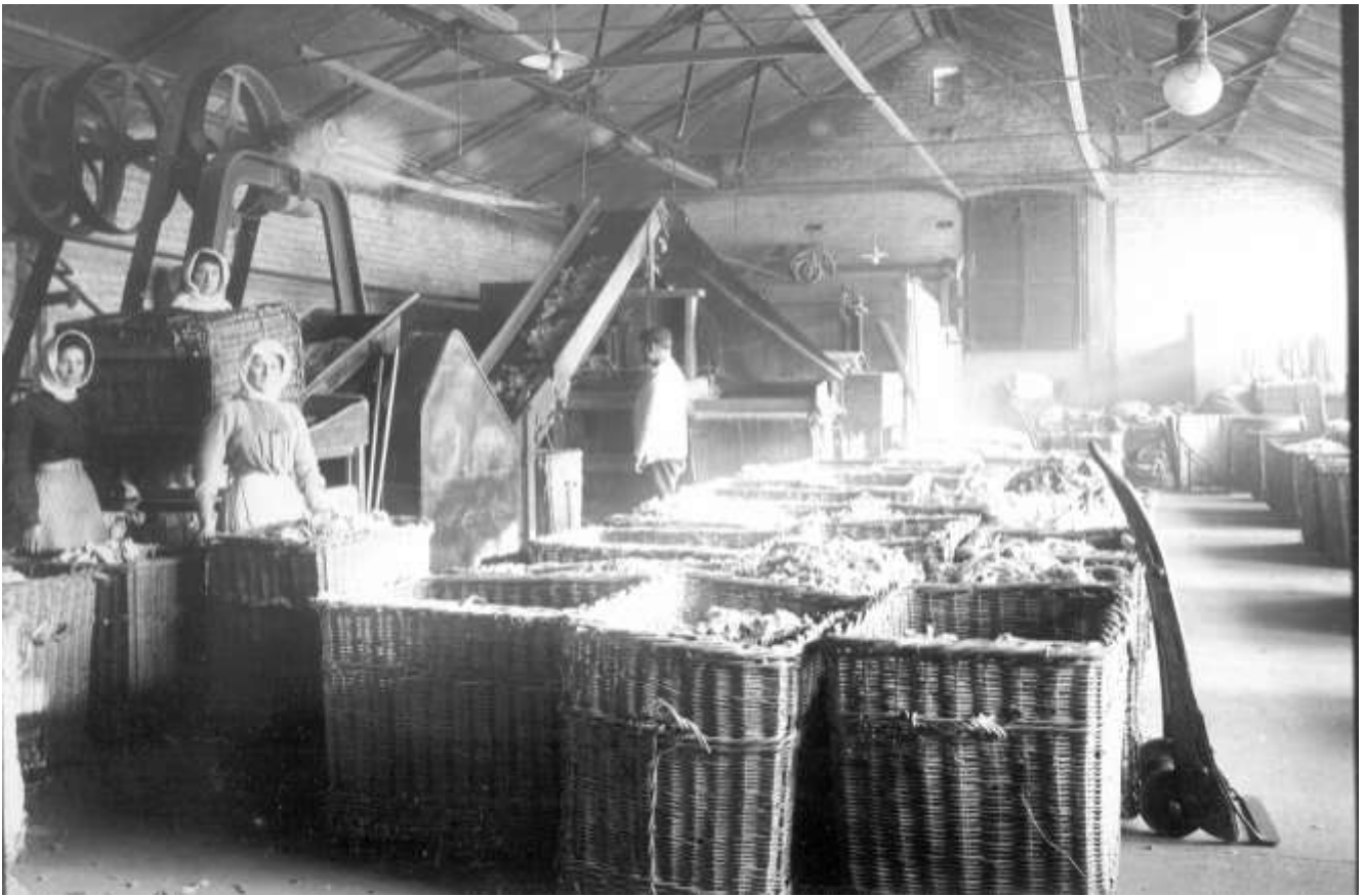
Midlothian was once renowned for its paper-making industry. This photograph shows rag-pickers at Valleyfield paper-mill, c.1905. Valleyfield in Penicuik was the largest of the Midlothian mills.