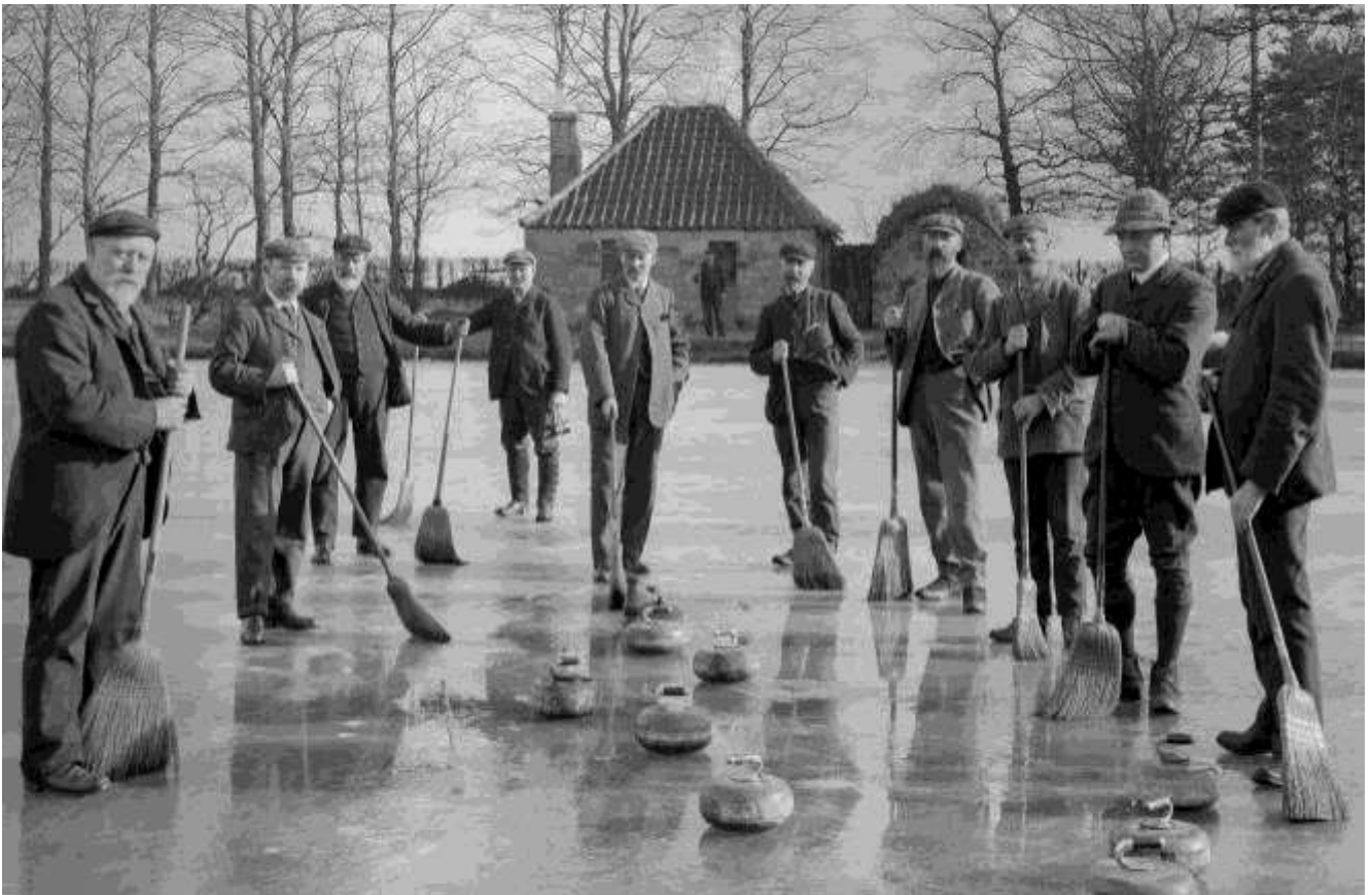
Roslin Curling Club was founded in 1816 and in 1895 an artificial pond was completed at Roslin, as shown in this photograph from c.1910.