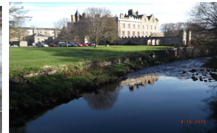
Newbattle Abbey College

Maiden's Bridge Later 15th Century single span arched bridge over the South Esk