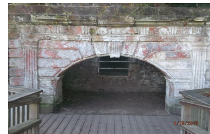
Newbattle Abbey College Grounds

200m away. Here you will reach the river path. Turn right along the river path. This area has quite few paths but as long as you keep heading upstream along any of these paths you will reach the A7 after about 400m.