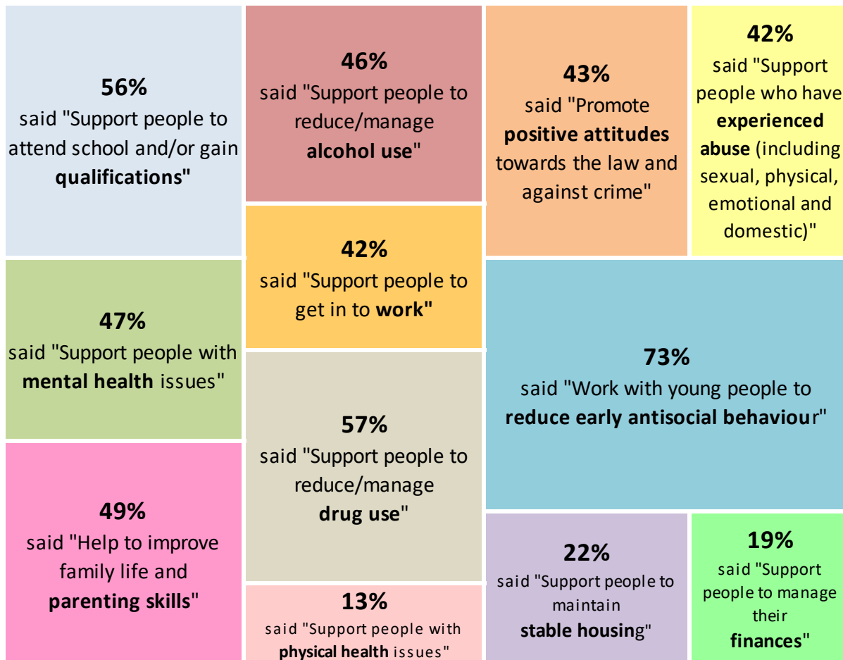
Figure 2: Factors prioritised by respondents as influencing desistance from offending

In the previous 2017 consultation, 40% of respondents prioritised "supporting people with mental health issues" as a means to reducing future (re)offending. This increased to 47% in the 2019 consultation, which suggests that there has been an increase in public awareness of mental health issues in the last two years and its potential to impact on (re)offending.