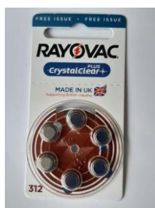
BROWN pack; Battery type 312

Cross check for the colour of packet and battery type being used (given as a number on lower left corner of packet)