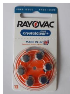
ORANGE pack; Battery type 13