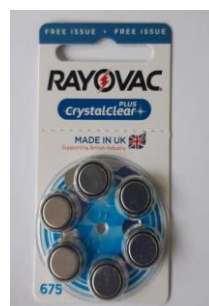
BLUE pack; Battery type 675

Audiology issue two battery packs at a time to clients.