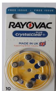
YELLOW pack; Battery type 10