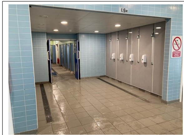
I will go this way and have a shower.