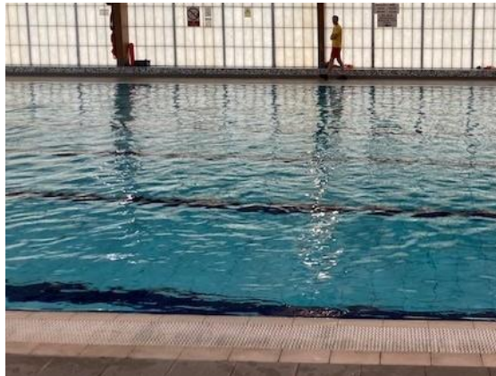
I will get in the pool.