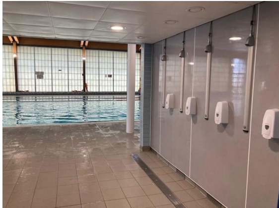
I will have a shower.