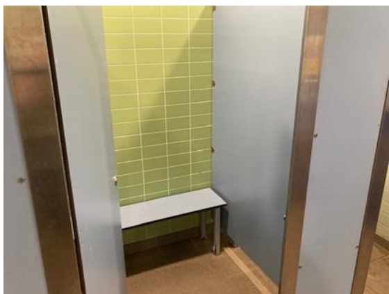
I will get dry and changed in a cubicle.