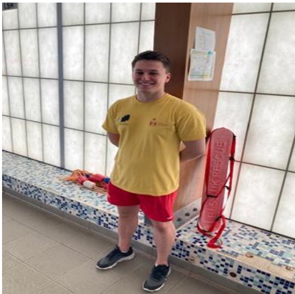
Lifeguards who can help me.