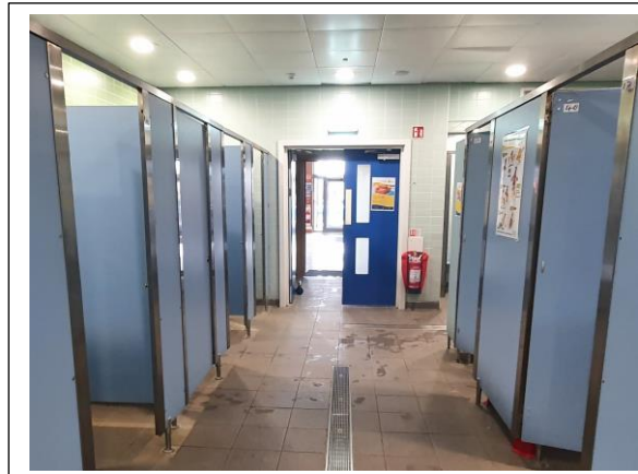
I will go this way to leave the changing village.