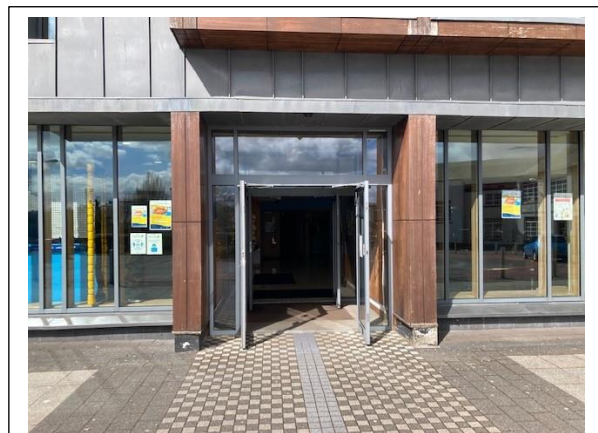
This is the way in.