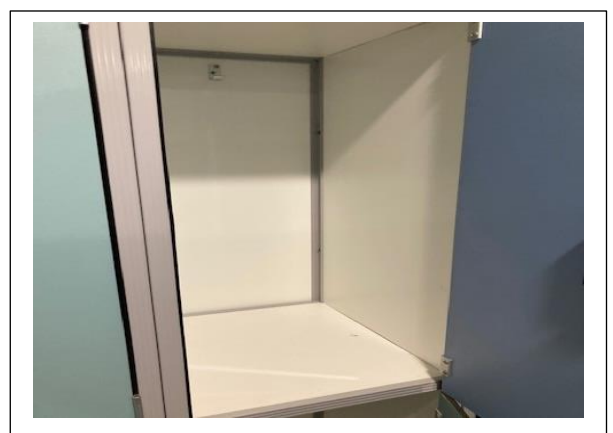
I will take my clothes and shoes out of the locker.