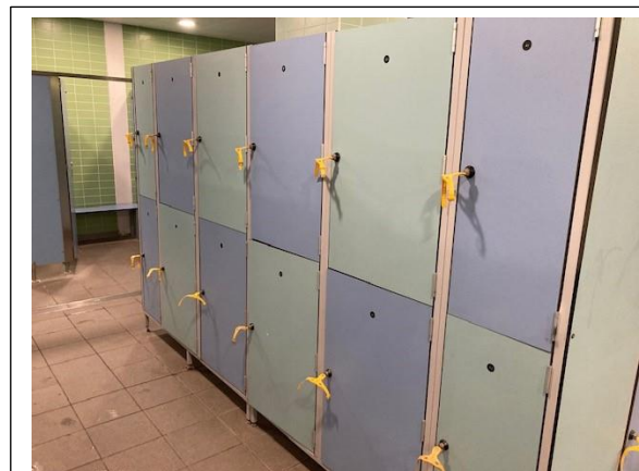
I will put my clothes and shoes in a locker