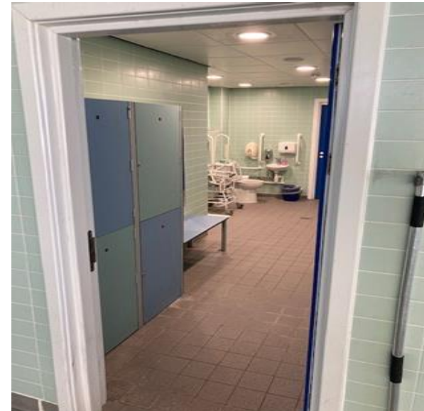
A quiet room if I need to take a break.