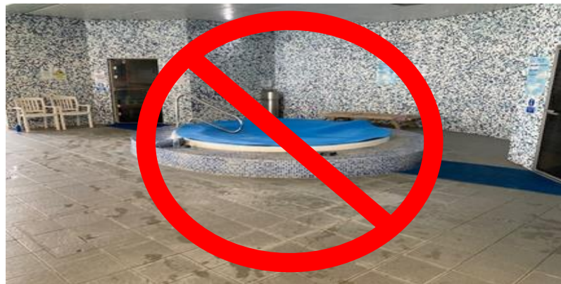
Today, I will not use the spa bath.