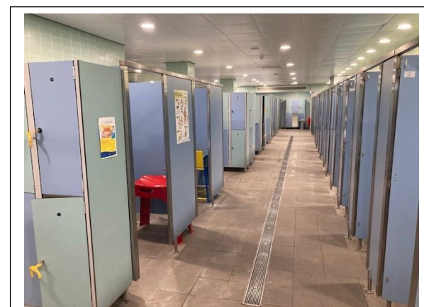
I will go this way to the changing village