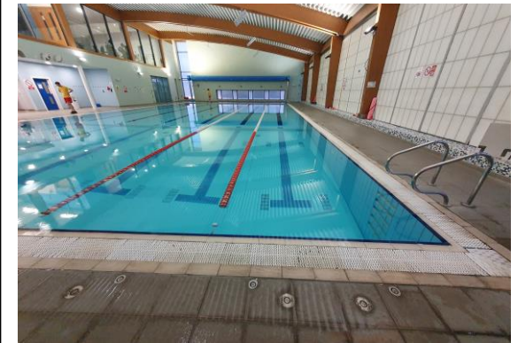
There will be two lanes set up in the pool for people to swim up and down.