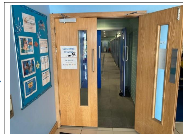
I will go this way to the changing village.