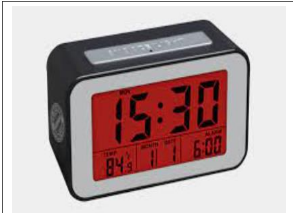
When time is up I will leave the pool.