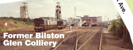
Former Bilston Glen Colliery