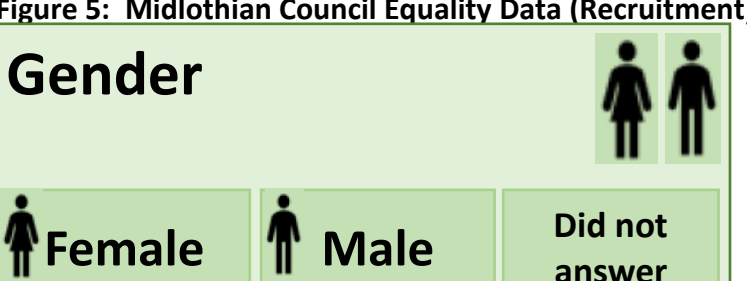
Figure 5: Midlothian Council Equality Data (Recruitment) Successful Candidates in Period – based on 948 Employees from 01/04/2022 – 31/03/2023