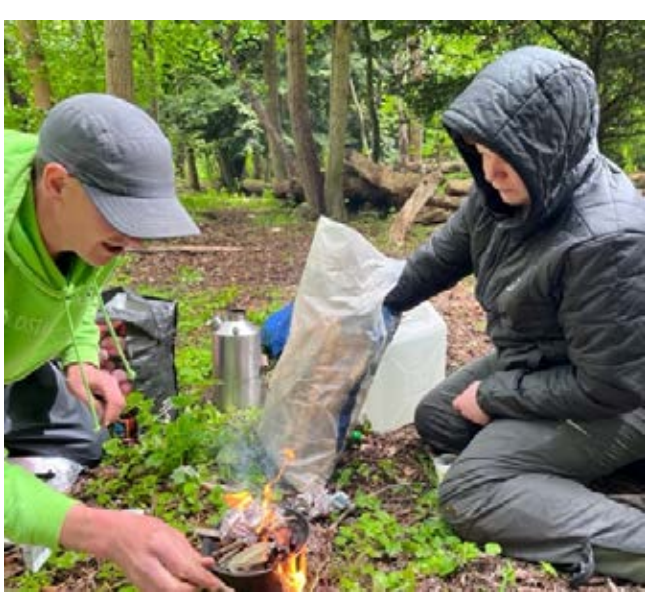
Dreghorn Woods: outdoor skills