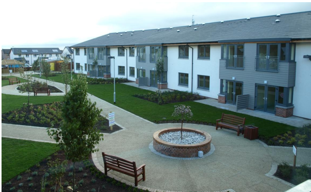
Figure 9.1: Cowan Court Extra Care Housing Development

The Council is working with health colleagues to deliver a flexible, person centred telehealth care service that will enable tenants to monitor their own conditions without having to visit their General Practitioner.