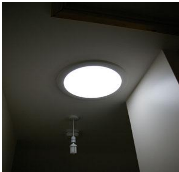
Figure 8.3: Example of a Sunpipe

At Midlothian Council's Extra Care Housing Development at Eastfield Drive there are several innovative approaches to improved energy efficiency which benefits the residents. A Combined Heat and Power Plant has been installed which generates heat and electricity for the 32 extra care flats which reduces the cost of fuel bills for these tenants and is also more efficient than being reliant on the national grid for all electricity needs. Sunpipes have also been used in the building which provide daylight in areas not well served by natural light which reduces the cost of lighting, thereby leading to savings whilst also making these areas look more attractive to residents (as shown in Figure 8.3).