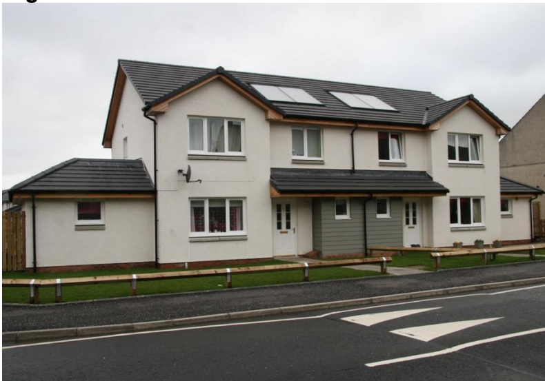
Figure 8.1 – Solar Panels on Council New Build Housing

In addition, at the New Park Gardens, Gorebridge and Eastfield Drive, Penicuik and Woodburn Road, Dalkeith sites, 100% provision of solar water heating has been achieved.